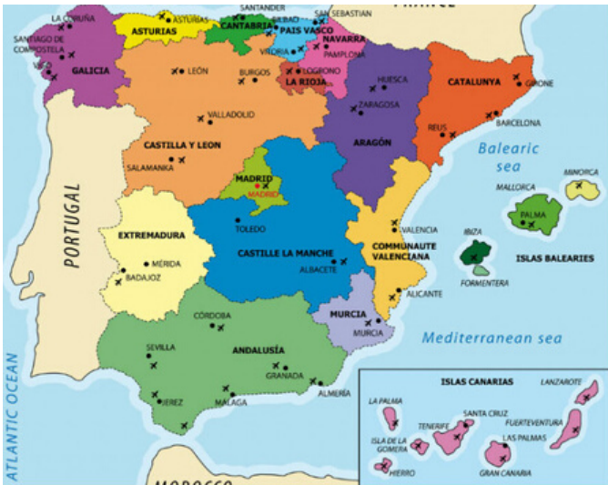
Map of Spain's regions.