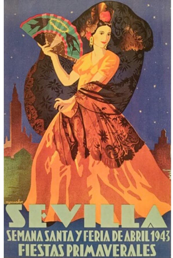
Posters for spring festivities in Seville, Spain, 1904 and 1943. Posters such as these advertised Semana Santa (Holy Week), the April Fair, and the opening of the spring bull fighting season.

In New Mexico, flamenco has found a home away from home. Now several generations of dancers and musicians hand the tradition down to students and younger family members. Private jam sessions (called juerga ) and flamenco parties exist alongside with professional performances in small nightclub venues and large theaters. The duende , or spirit of flamenco, is forever etched in the minds and hearts of New Mexicans.