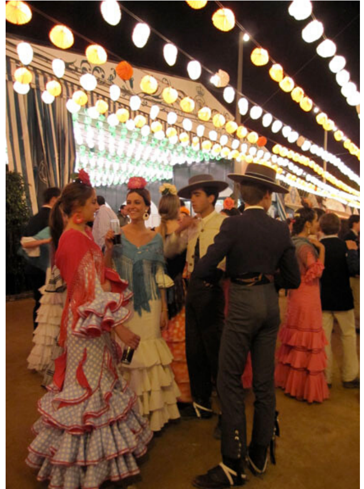
Fairgoers in Seville, Spain, 2012.

Within the historical discourse on flamenco there is considerable debate regarding the amount of mixing that took place among regional dances, the various cultures of Spain, and traditions of pure Gitano origin. The earliest spread of a musical style particular to Andalucía took place at the beginning of the 2nd century CE when Spain was part of the Roman Empire. Later influences include Arabic, Christian and Sephardic musical styles. The Gitanos arrived during the medieval era bringing with them the cultures of India, Eastern Europe, and the Byzantine Empire, along with their own personal heritage. All of these traditions mixed with the music of southern Spain and became a part of the family of flamenco song and dance.